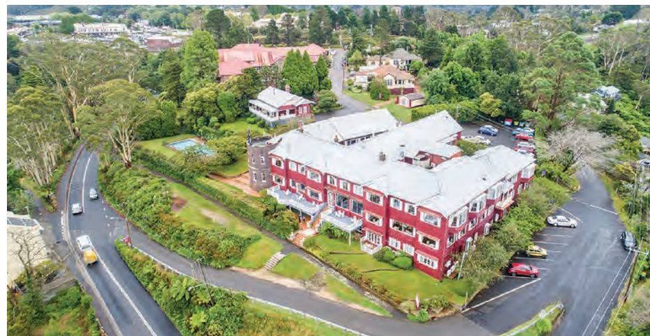
Hotel Mountain Heritage is located in the heart of Katoomba.

E scape to Hotel Mountain Heritage this Yulefest with their exclusive dinner and accommodation package.