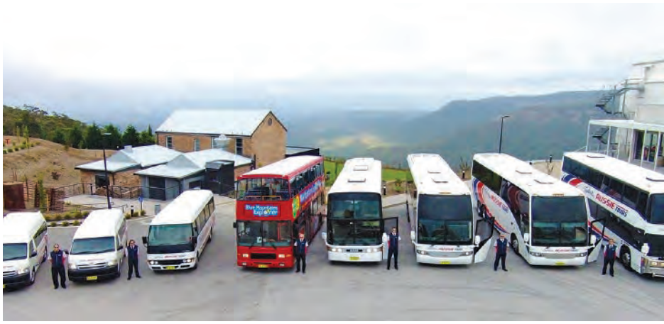
Fantastic Aussie Tours and their fleet of vehicles.

Their buses are iconic all over the Blue Mountains, and now local business Fantastic Aussie Tours is gearing up to celebrate its 50th birthday later this year.