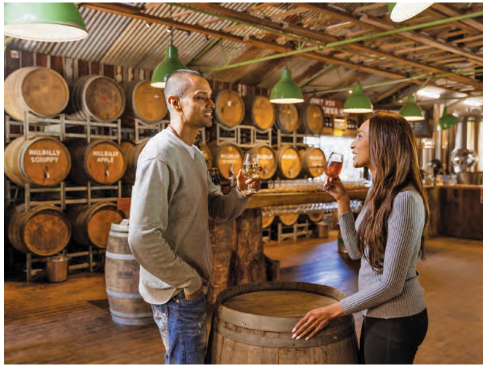
Hillbilly Cider at Bilpin.

modation rooms at Echo Point Discovery Motel to offer a more comfortable stay with eco-friendly features in contemporary cosiness in designs inspired by the nearby Echo Point.