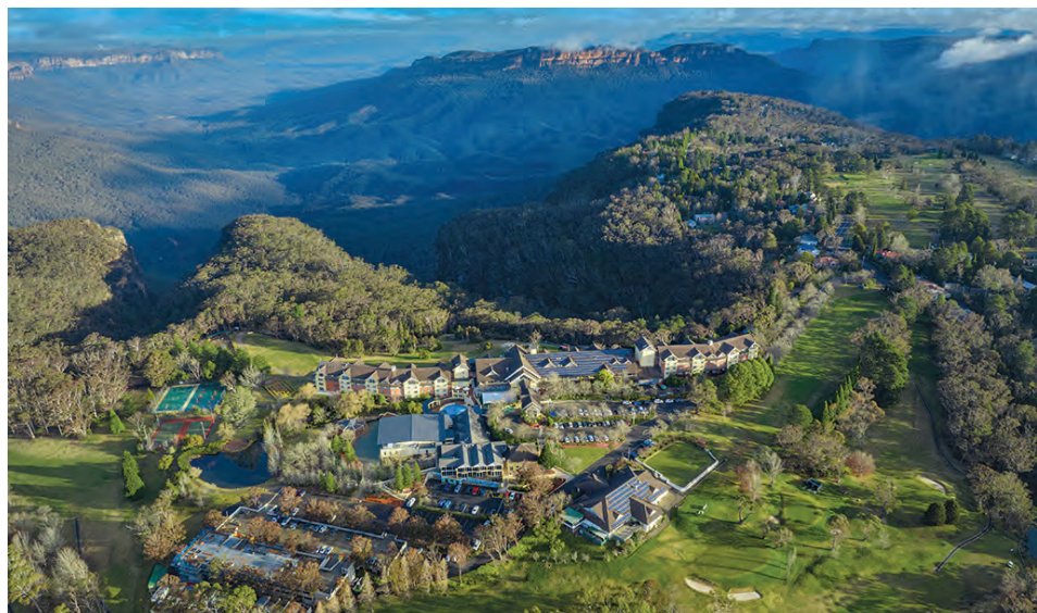
The picturesque Fairmont Resort Blue Mountains.

Situated on the edge the Jamison Valley - part of the World Heritage-listed Blue Mountains National Park - the award-winning Fairmont Resort Blue Mountains is the pinnacle of luxury accommodation in Leura.