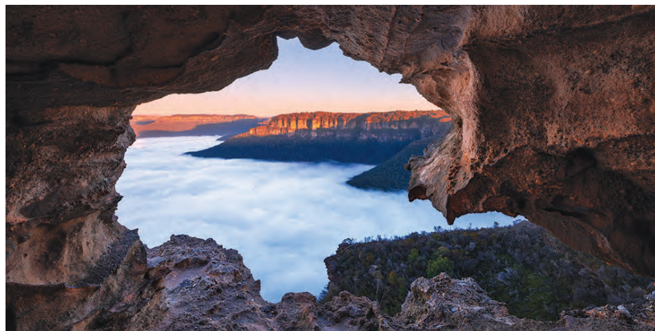
The Blue Mountains has an abundance of amazing lookouts.

Plan your Blue Mountains experience at visitbluemountains.com.au .