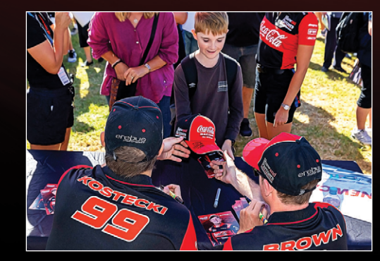
DRIVER SIGNING SESSIONS