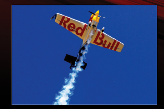
MATT HALL RED BULL AIR DISPLAY

ENTRY IS INCLUDED WITH YOUR SAME-DAY EVENT TICKET.