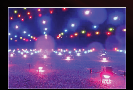
BEAUREPAIRES SYDNEY SUPERNIGHT ATN DRONE SHOW

UNFORGETTABLE RACING UNFORGETTABLE ENTERTAINMENT