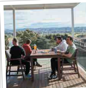
Specialist Disability Accommodation