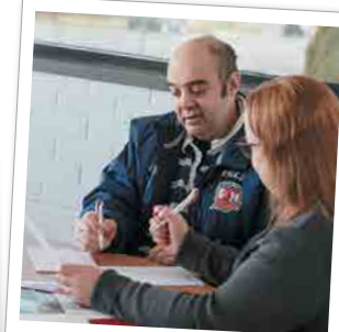
Support Coordination & Plan Management

Innovative accessible homes, vibrant country living