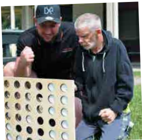
Lifestyle & Learning Day Program