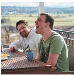
Supported Independent Living