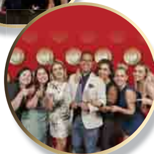
Southlands Estate Agents Outstanding Real Estate Agency