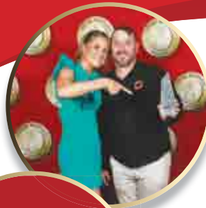
K&A Quality Meats Outstanding Butcher/Delicatessen