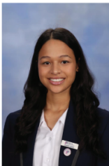
Espri Footman Visual Arts SOR II